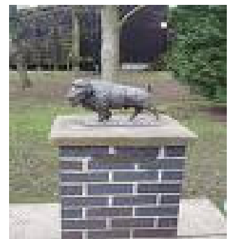
The Silver Buffalo for the Unknown Scout in Gilwell Park.

Favorite Food: Pasta has taken first place with variations of any pasta to specifically Lasagna. Steak was in the running. Other favorites were: Sweet and sour stew, Lemon Chicken, Picadillo, Shish-Ka-Bobs, Meatloaf, BBQ Chicken, Mexican (only if done right), anything from the Dutch oven or the smoker, anything with garlic. Other choices were fresh picked apples and anything milk chocolate. Hey, Quartermasters, getting any ideas for the final feast?